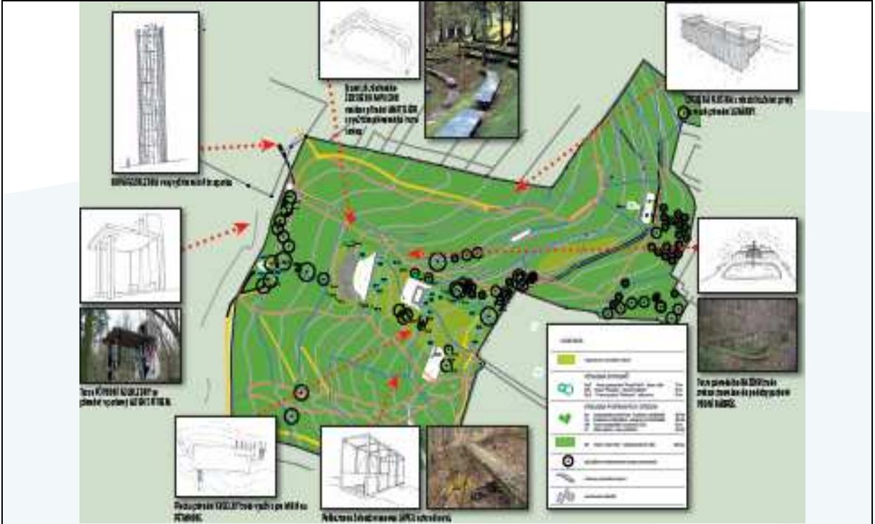
New contemporary architectonic interpretation of forest park