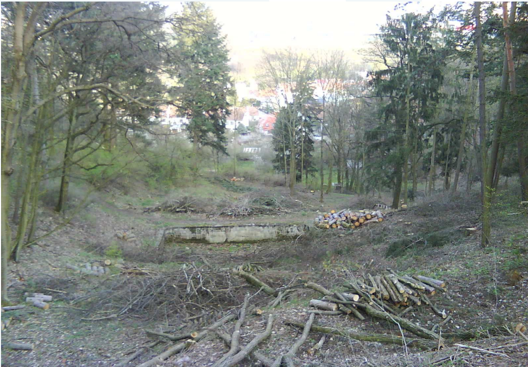
Photo of general greenery renewal - started in 2009