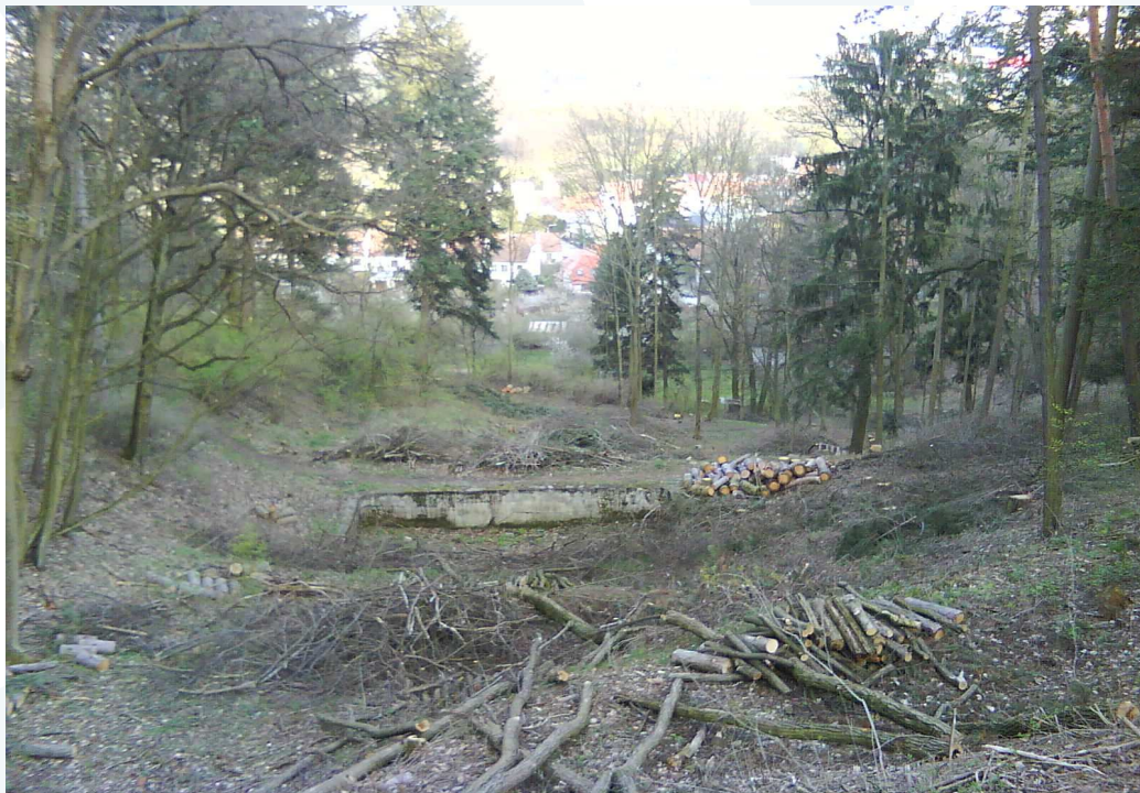
Photo of general greenery renewal - started in 2009